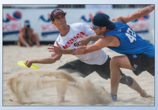
Page 12 / WBUC 2023