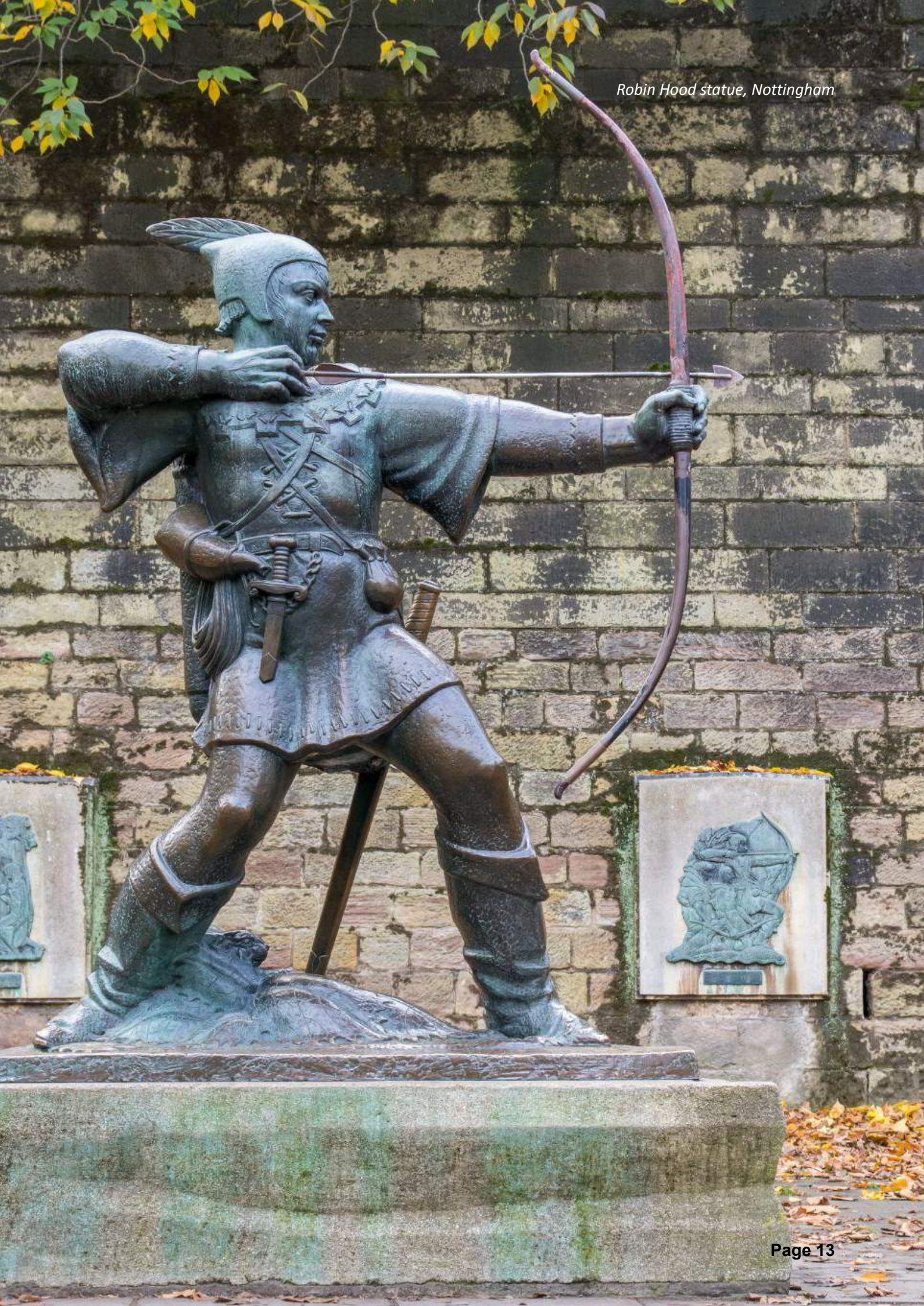
Robin Hood statue, Nottingham