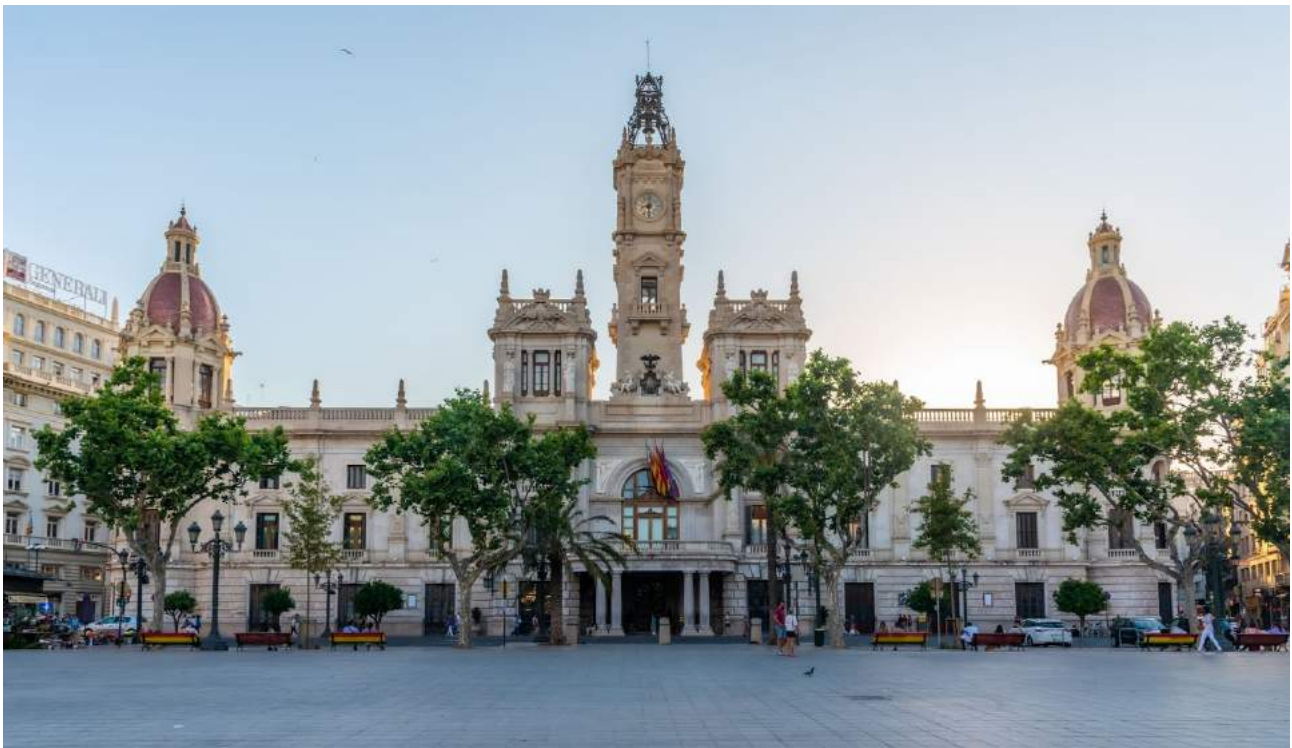
Town hall in Spanish town Valencia

WFDF strives to protect transgender athletes and to recognise the importance of autonomy of gender identity in sport and has created clear guidelines with minimally invasive requirements for TUE submissions. The guidelines were developed by the Medical and Anti-Doping Committee. EBUC will abide by timelines and requirements as outlined in the WFDF Transgender Athlete and Differences in Sex Development (DSD) Athlete Policy .