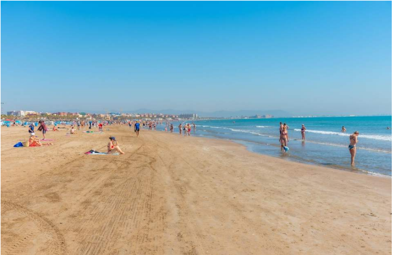
Cabanyal beach in Valencia, Spain.