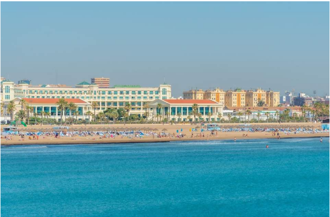
Landscape of Cabanyal beach in Valencia, Spain.