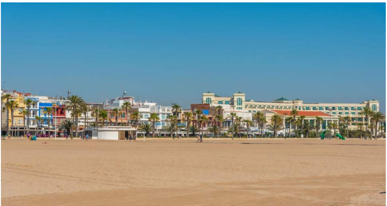
Seaside waterfront in Valencia, Spain.

The official Athlete Party for EBUC will be hosted on Saturday 30th November in the evening. Medal Ceremonies will take place immediately after each final. The Closing Ceremony will take place on Sunday December 1st November , at the end of the last final of the EBUC Tournament.