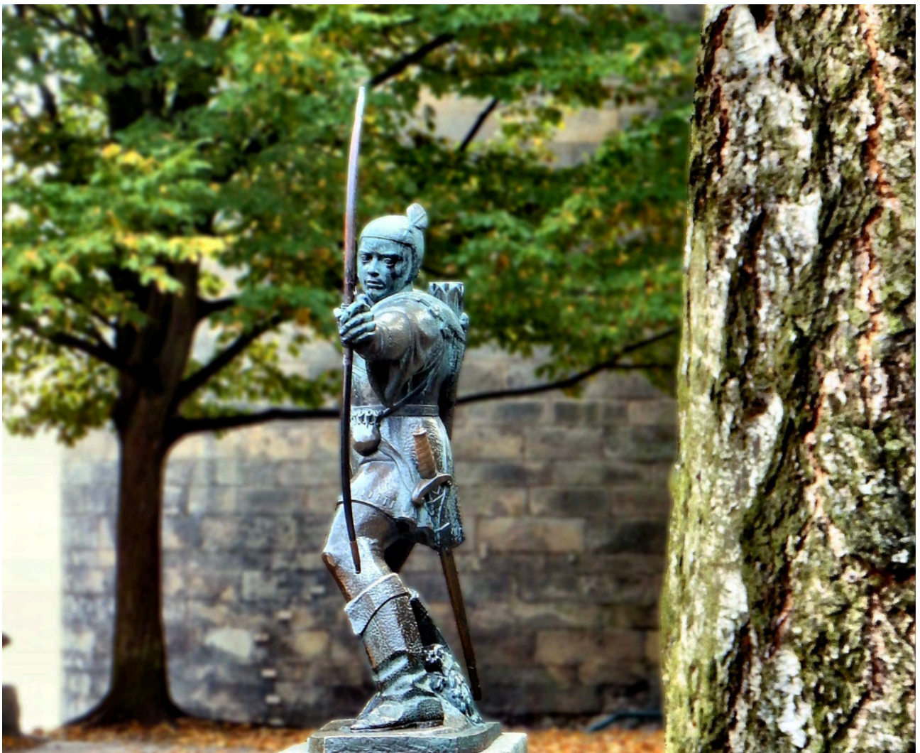
A Statue of Robin Hood in the City Centre

Congratulations on being part of the biggest WFDF World Championships ever! We are expecting over 140 teams from 32 countries competing in 9 divisions, which will be more than 3,500 participants! Now that you've paid your team and player fees it's time to choose the best place for your team to stay. We have partnered with University of Nottingham & Visit Nottingham to offer a wide range of accommodation options to suit all budgets. There are also many other options including stately homes, campsites, holiday homes, guest houses, bed and breakfasts, pubs, inns, hotels and more in the surrounding area that you are welcome to book directly.