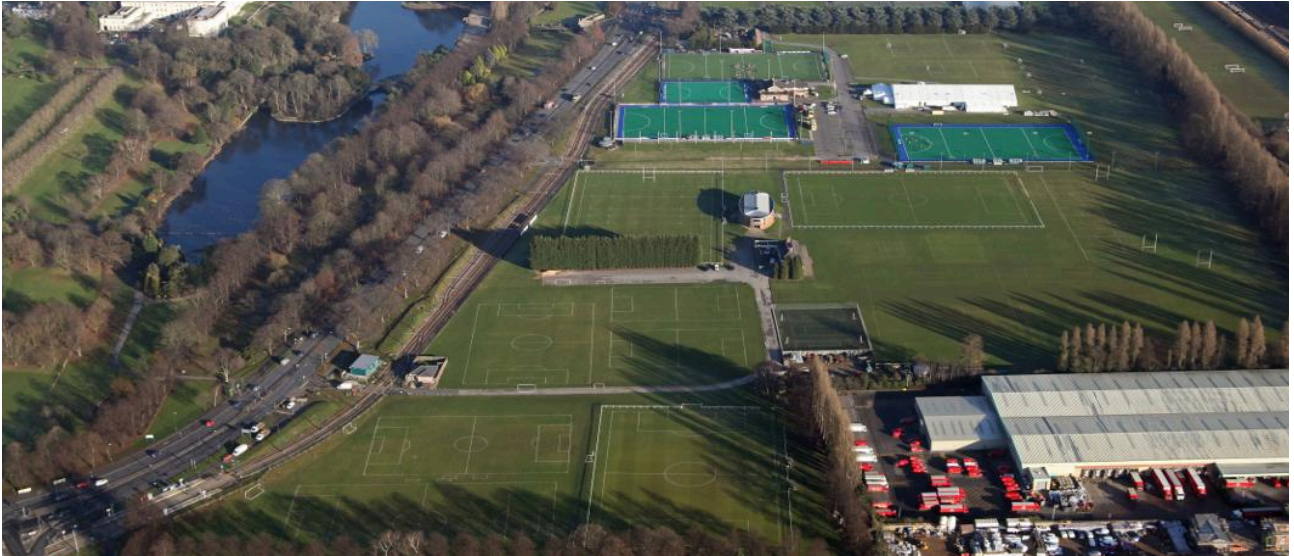
Aerial image of the Highfields Sports Complex, Nottingham