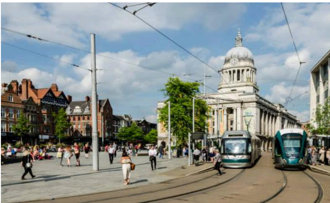
Nottingham trams run between the city centre and the University campuses & Highfields