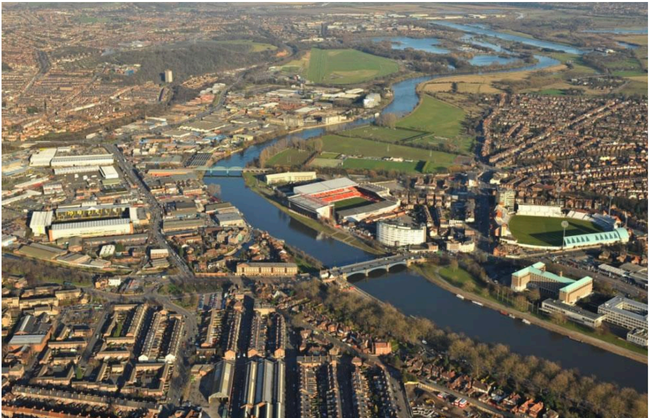
A view of the River Trent through Nottingham

**Some finals may be on Fri 3 July and some placement games may be on Sat 4 July.