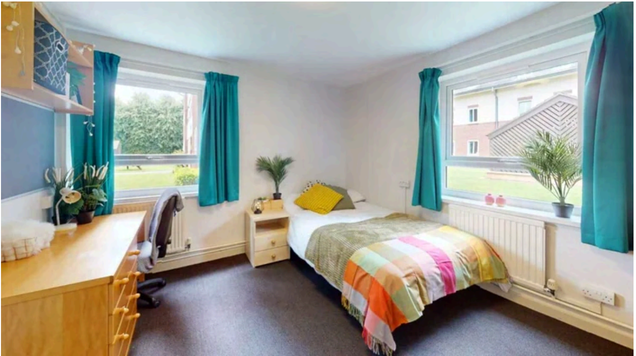
A Single Study Studio Bedroom in Broadgate Park