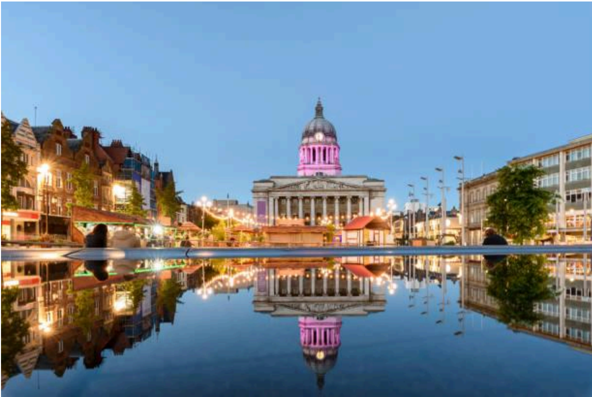
Market Square in Nottingham City Centre

We have partnered with Visit Nottingham to secure rates and availability across a range of hotels in Nottingham. Although you are welcome to book directly with Hotels, the rates from Visit Nottingham should help with group bookings and a fixed budget. All rooms include breakfast and wifi. Some rooms include parking and access to leisure facilities.