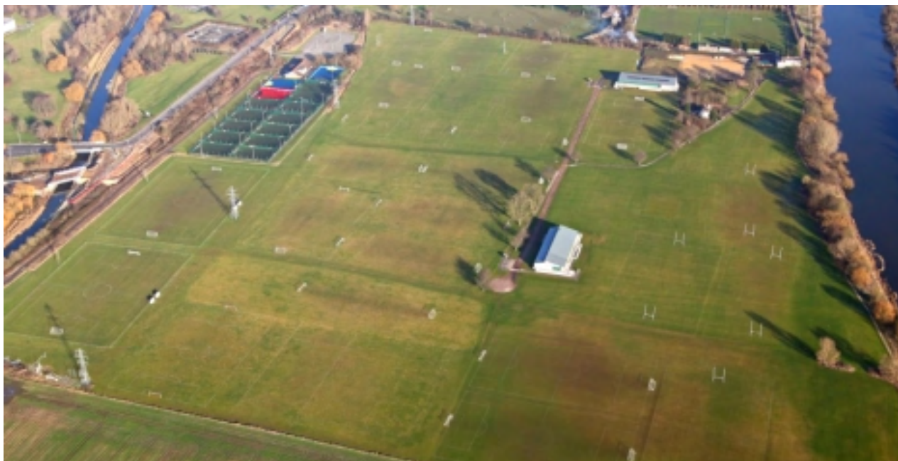
Aerial image of the Riverside Sports Complex, Nottingham