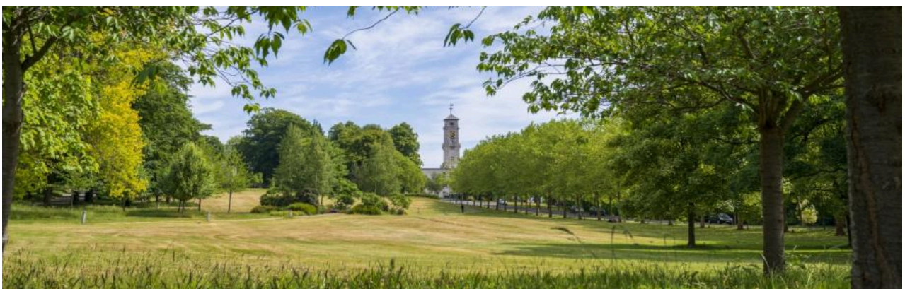
A view of the University Park Campus in Highfield Parks