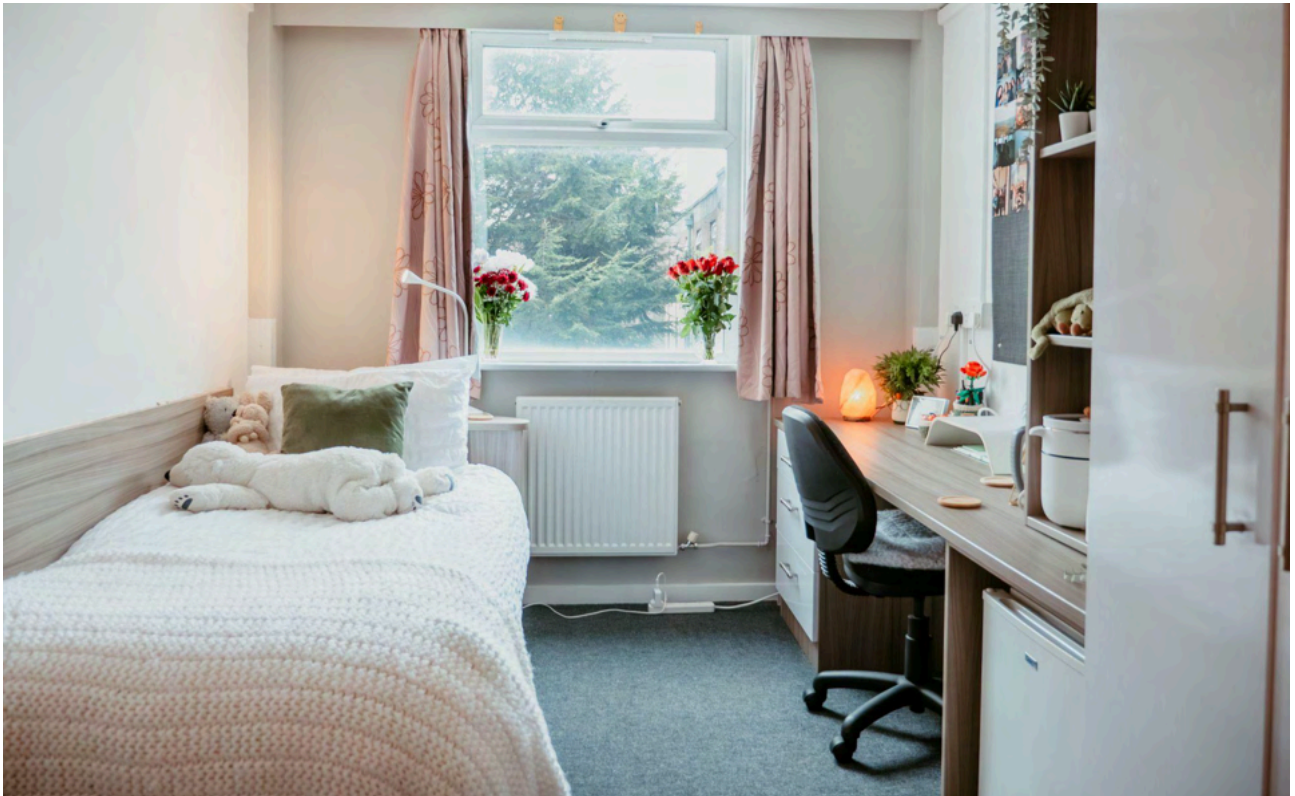
A Single Study Bedroom in Sherwood Hall