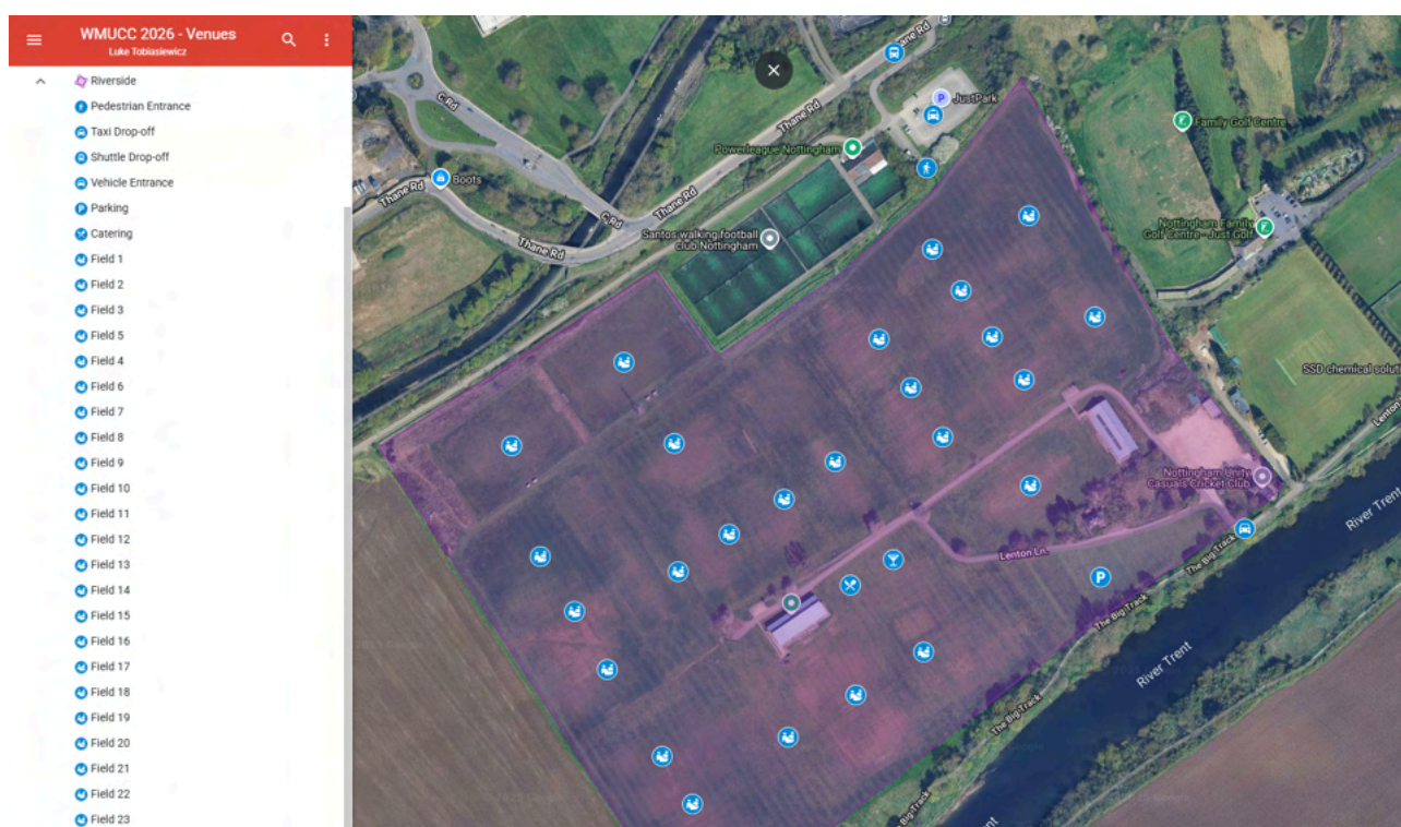
Click the image for an interactive Google Map of the event