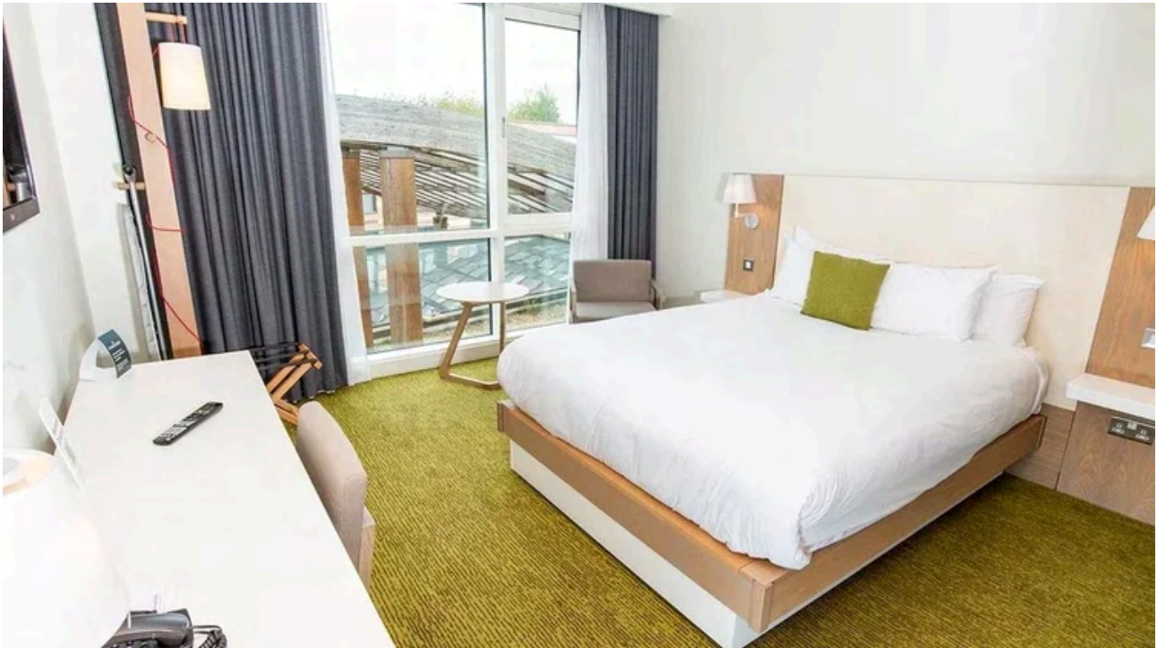
A Double Bedroom in the Orchard Hotel