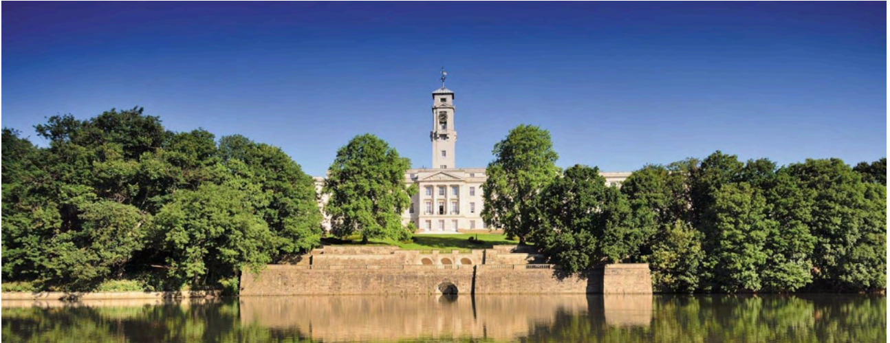
Boating Lake in Highfield Park at the University Park Campus

There are 100's of other Hotels, Guest Houses, Holiday Homes, Apartments, Campsites and more available in the local area that can be found through your favourite search engines and booking portals. Other local cities are well connected to Nottingham with an excellent road network should you wish to stay further afield. IF you are struggling to find something suitable for your team, please don't hesitate to contact us and we will do our best to assist you.